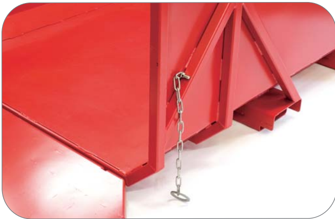
Open rear flap