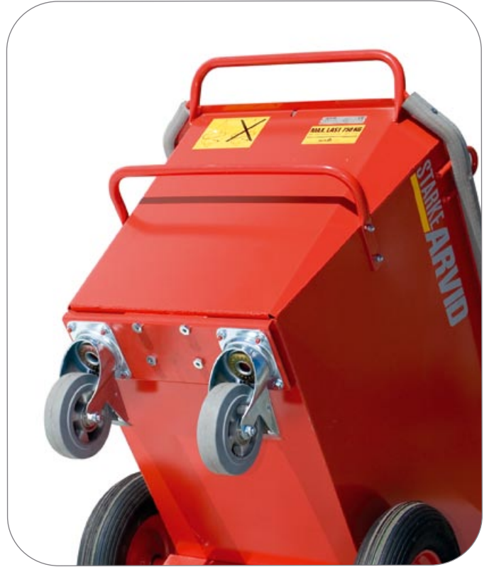
Double castors Double handles