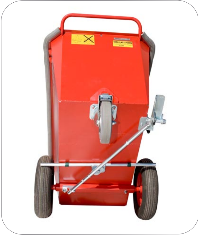
Hand and foot brake