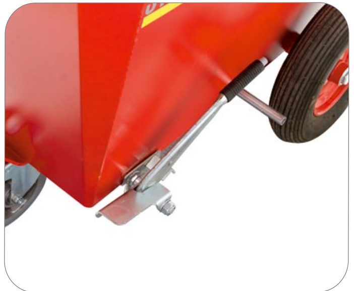
Hand and foot brake Polyurethane-filled wheels