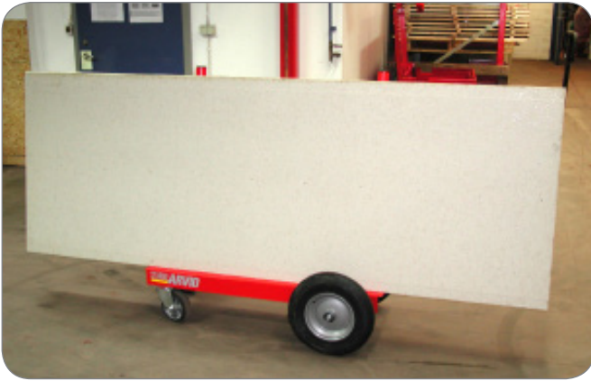
The load does not obstruct the view or create a large overhang