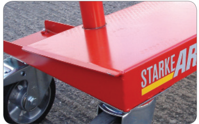
Angled edge on the short side reduces wear on the boards