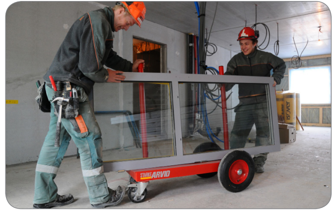
Two swivel castors, one of which is lockable, at the rear